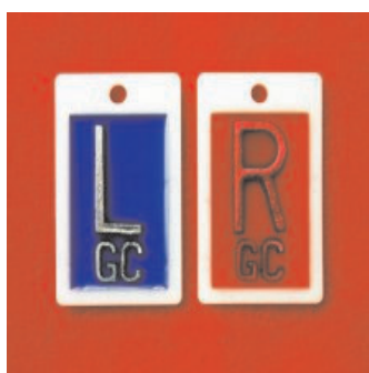
Cat. No. 1E R&L - 5/8" 4E same as 1E without initials