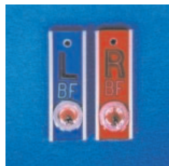
Cat. No. TA-13 Elite Style R&L 5/8" 2 initials - 3/8" or 3" initials - 1/4"